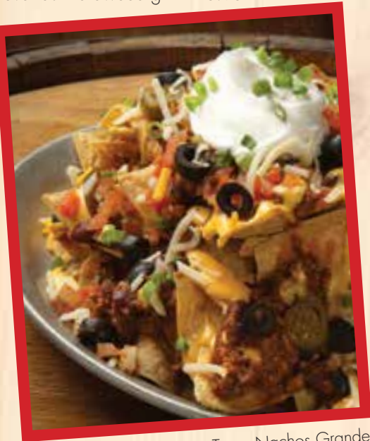
Texas Nachos Grande

Gardien™ grilled over mesquite with sautéed peppers, onions and tomatoes glazed with smoked onion BBQ sauce 20.95