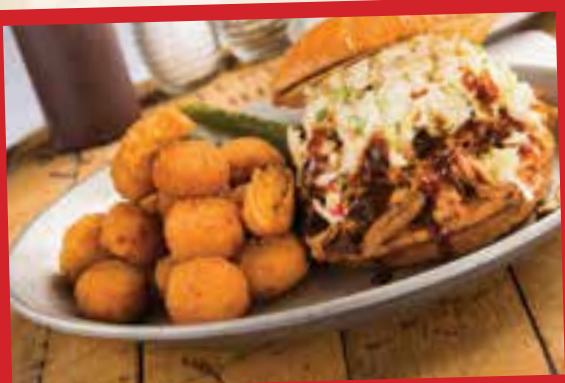
BBQ Pulled Pork Sandwich

*Thoroughly cooking foods of animal origin such as beef, fish, lamb, milk, poultry, or shellstock reduces the risk of foodborne illness. Young children, the elderly and individuals with certain health conditions may be at a higher risk if these foods are consumed raw or undercooked.