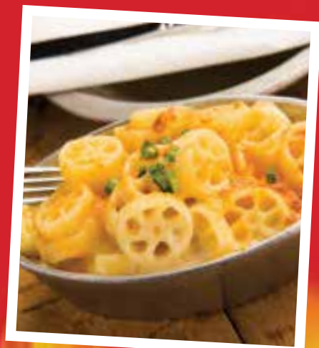
Two Cheddar Macaroni & Cheese

*Thoroughly cooking foods of animal origin such as beef, fish, lamb, milk, poultry, or shellstock reduces the risk of foodborne illness. Young children, the elderly and individuals with certain health conditions may be at a higher risk if these foods are consumed raw or undercooked.