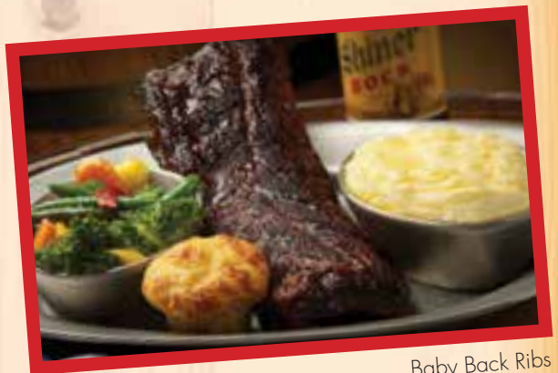
Baby Back Ribs