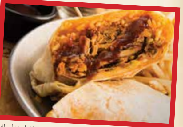
Pulled Pork Burrito

House-made turkey burger topped with zesty house-made tomato jam and grilled onions 16.95