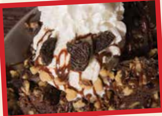
Warm Chocolate Walnut Brownie Sundae

Home-style scratch-baked buttermilk biscuit, fresh strawberry sauce & whipped cream