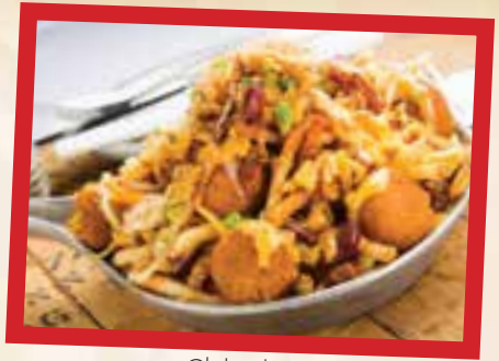
Chili Cheese Fries and Tots

Warmed in the oven and lightly salted, served with Crown Royal Maple mustard and cheese sauce 9.95