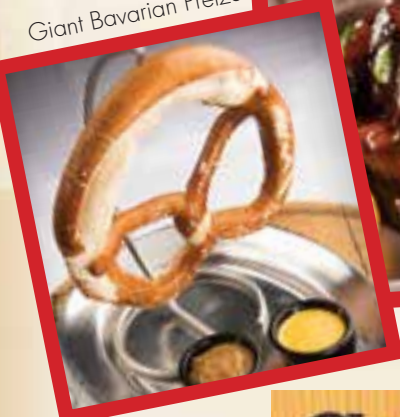
Giant Bavarian Pretzel

A taste of some of our favorite menu teasers. Buffalo wings, onion rings, chicken tenders and spicy cheddar tater tots 18.50