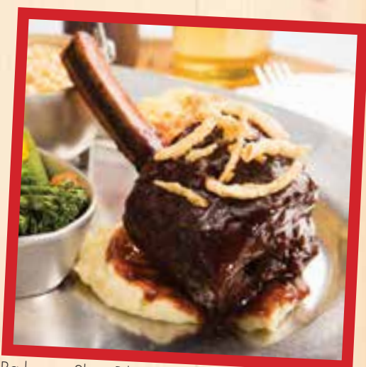
Barbeque Short Rib

Smoked and then braised until fork tender. Served atop whipped potatoes with Dr. Pepper BBQ glaze and crispy onion straws 33.95