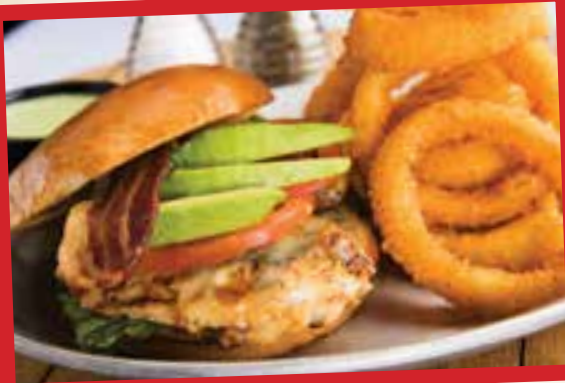
Chipotle Chicken Sandwich

Meatless patty with pepper jack cheese, grilled onions and peppers on a custom bun 16.95