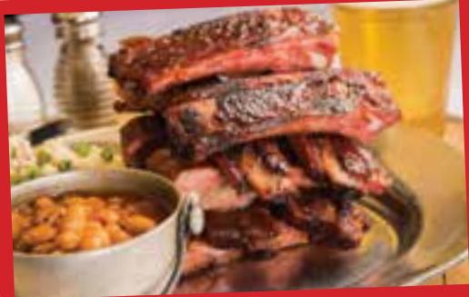
St. Louis Spare Ribs

Meat Selections Include: 1/2 rack of St. Louis spare ribs, 1/2 rack of baby back ribs, hot links, BBQ pulled pork, sliced brisket or 1/2 rotisserie chicken