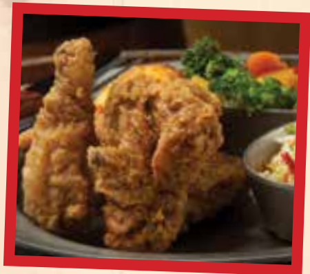
Southern Fried Chicken

Marinated in garlic, lemon and olive oil and grilled over our hardwood grill 26.95