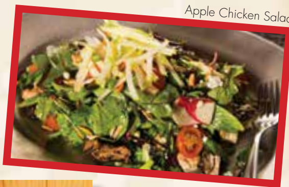
Apple Chicken Salad

The best in the west, garnished with avocado, cilantro, shredded pepper jack cheese, crispy tortillas and sour cream 6.95