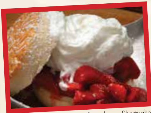
Down Home Strawberry Shortcake

Fresh bananas, Nilla wafers, cinnamon, caramel, and whipped cream