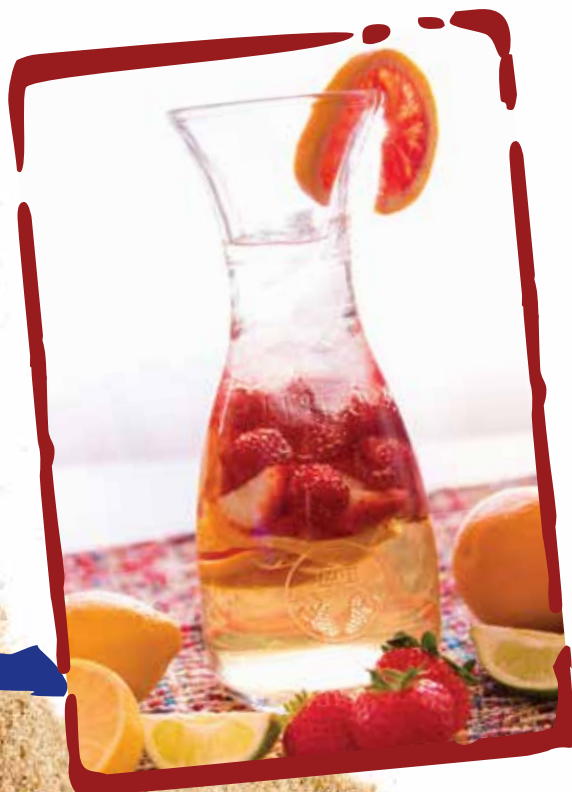
White Sangria Pitcher

Sauvignon Blanc & Sparkling Wine infused with Tangerines, Peaches, Lemons & Limes, served chilled with Assorted Fresh Fruit