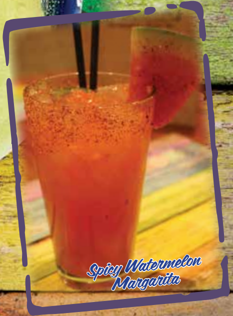
Spicy Watermelon Margarita